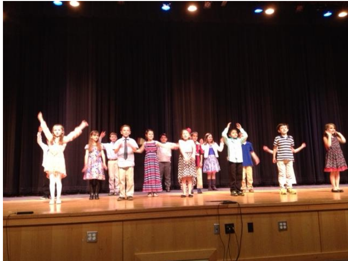
2nd Grade Merengue Dancers from Birch Meadow Elementary School