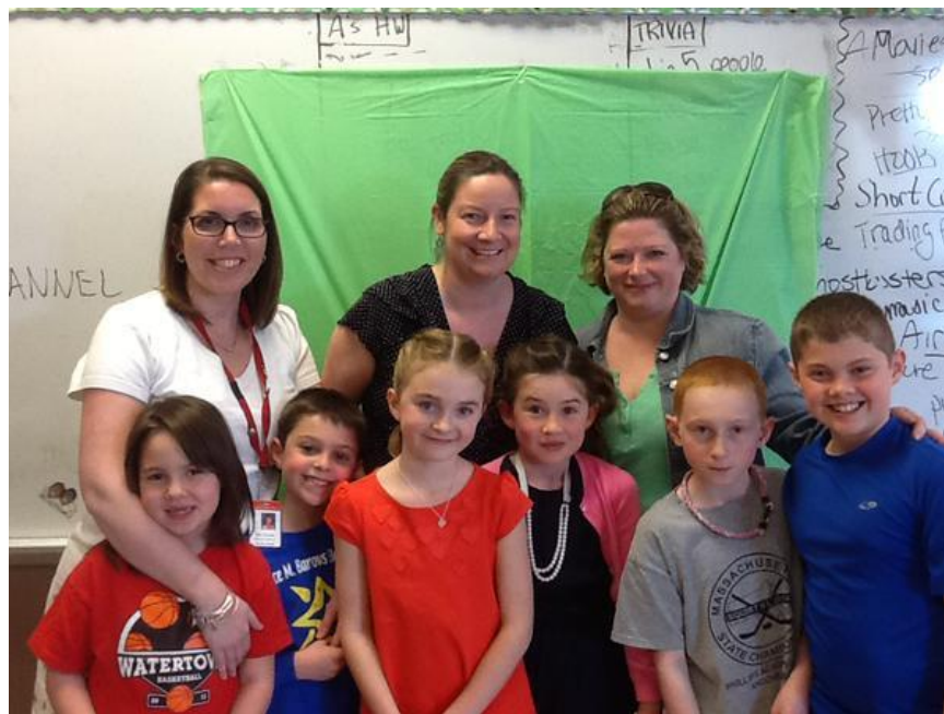
Barrows News Team Who Presented at Conference