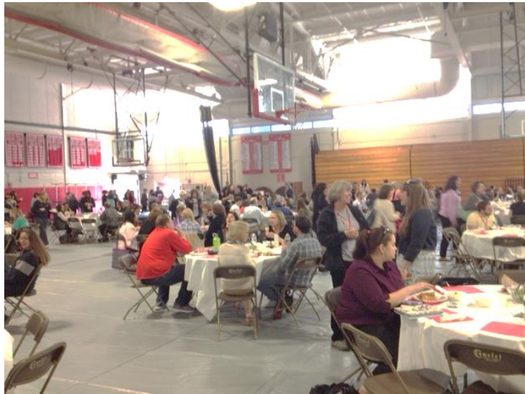
Lunchtime Networking at Conference

( https://www.cradlestocrayons.org/boston )