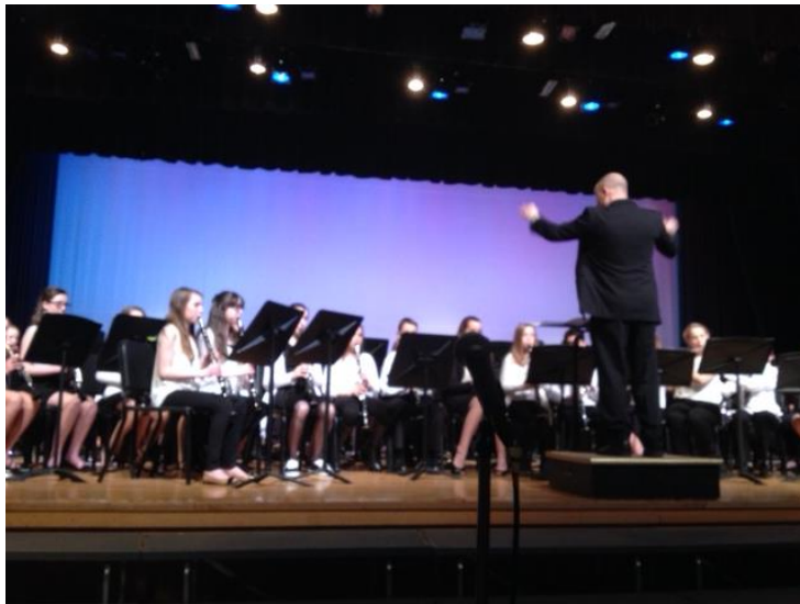
Grade 6 Band