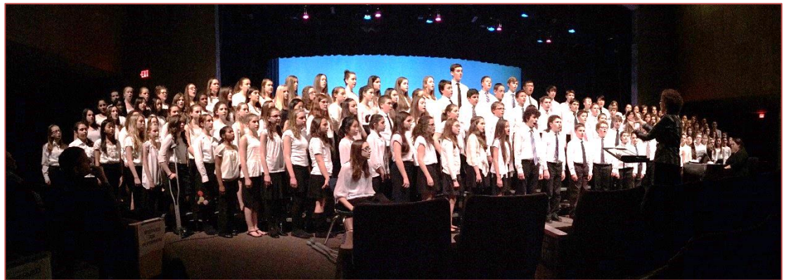
Grade 7 and 8 Chorus

The week leading up to April Vacation has, over the years, become a week to celebrate teaching and learning in our school district. The week began with ArtsFest, A Celebration of Student Achievement in the Arts, which showcased our music performing arts groups and our visual arts. Below are some photos from the event.