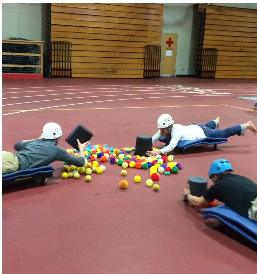
RPS Wellness Teachers Practicing the "Hungry Hippo" in a Team Building Workshop