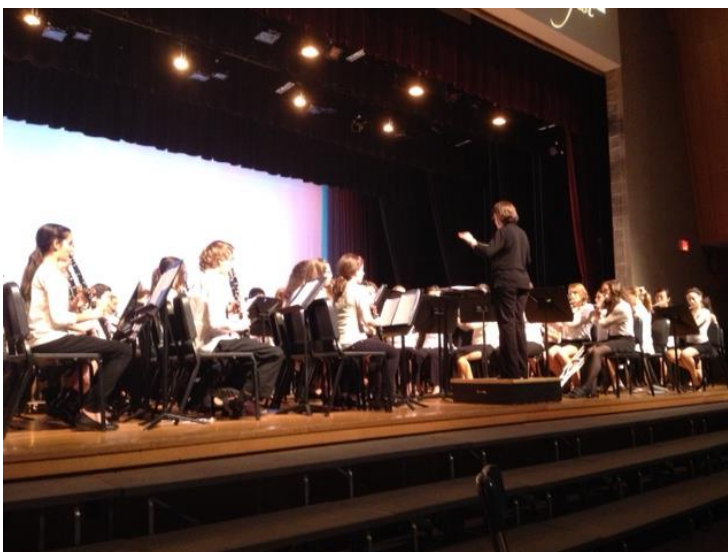
Grade 7 and 8 Band