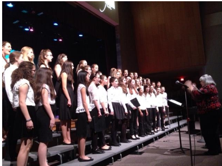
Combined Middle and High School Chorus