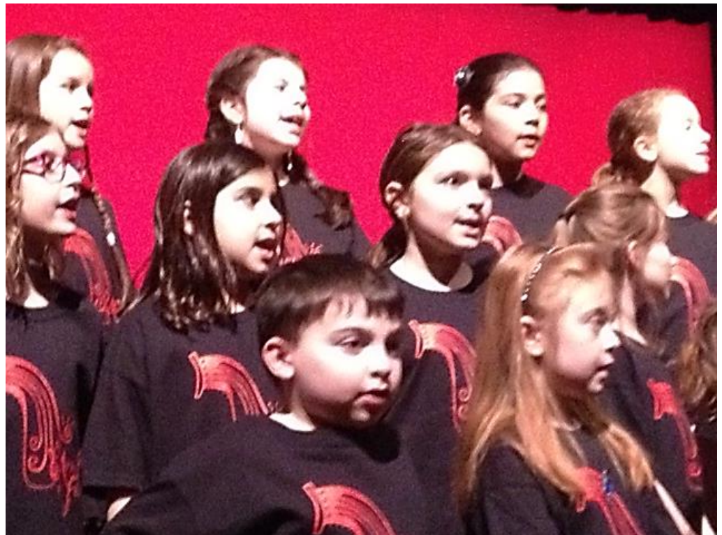
Grade 3 Chorus