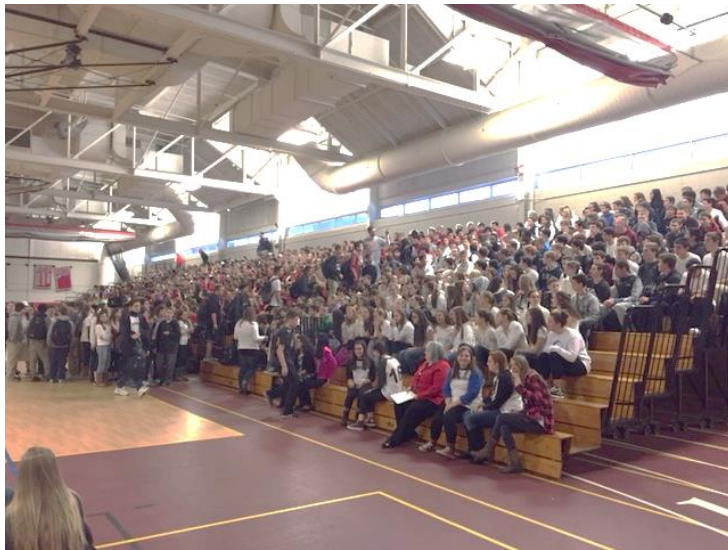
RMHS Students Preparing for Rally