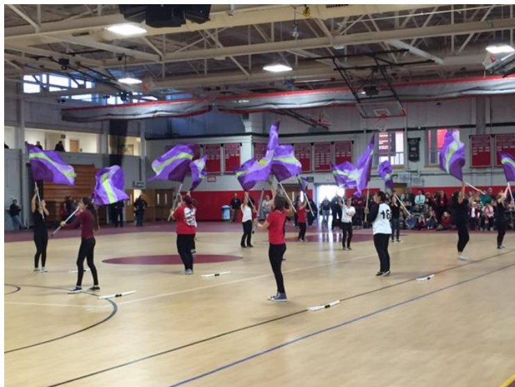
RMHS Color Guard