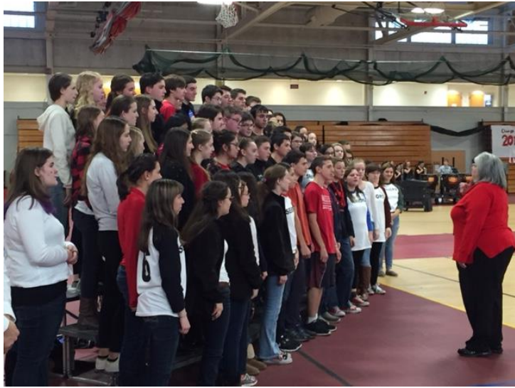
RMHS Chorus Singing National Anthem