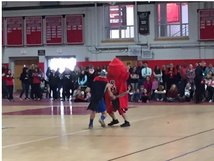
Rocket Mascot battles the Spartan Mascot