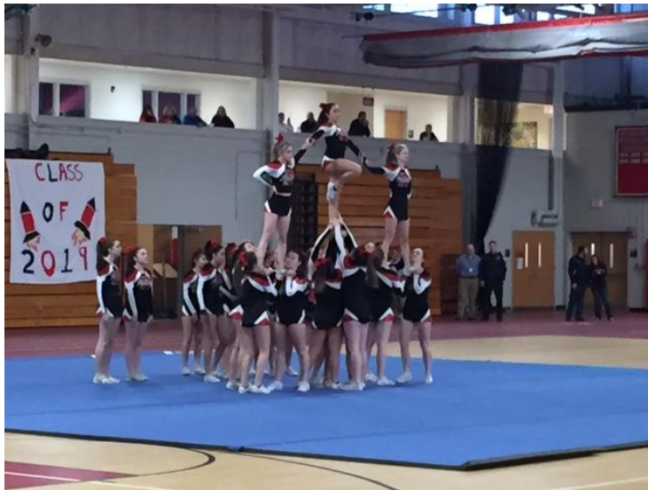
Middlesex League Champion RMHS Cheerleaders