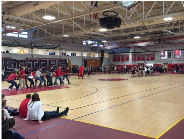
Teachers vs. Senior Class Tug of War