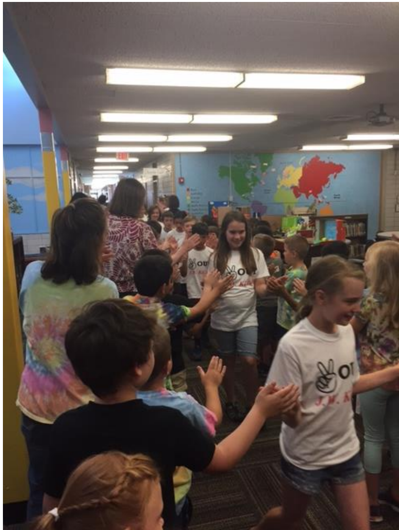
Killam Grade 5 Students Leaving the Assembly High Fiving the Rest of the School