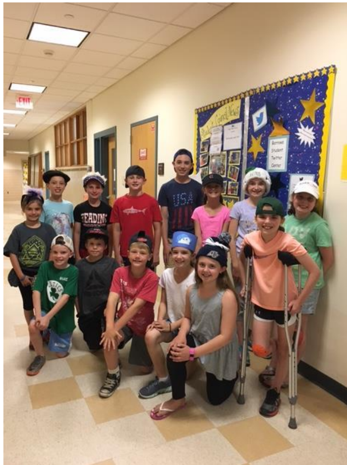
Barrows Student Council